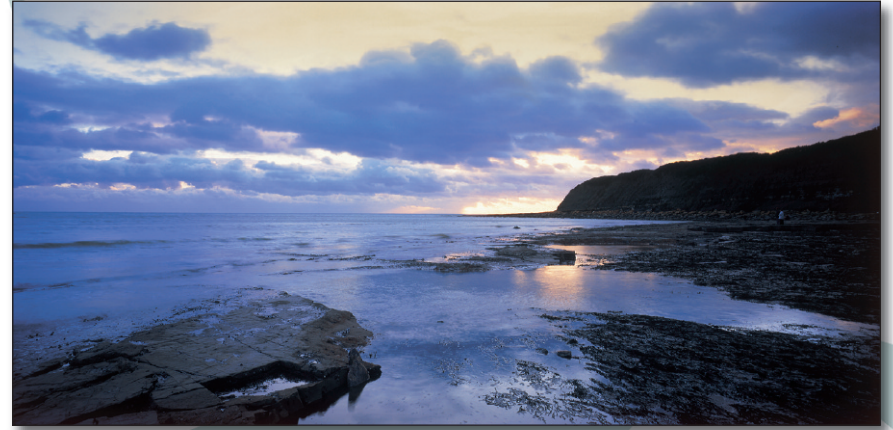
The Kimmeridge Ledges.