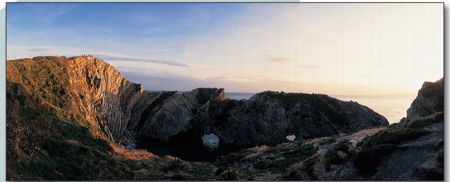
Stair Hole, Lulworth, a miniature Durdle Door created by sea erosion.