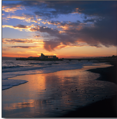
Bournemouth Pier at sunset.