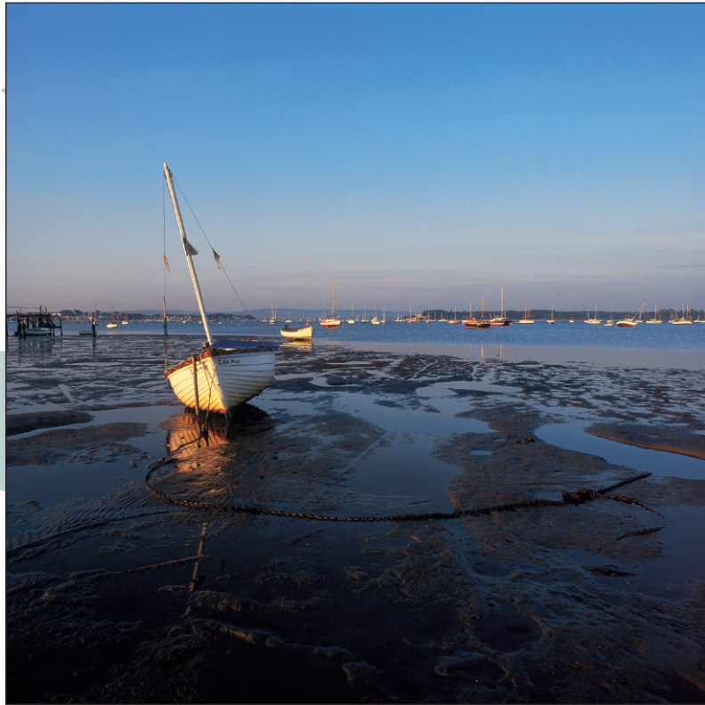
Boats in Poole Harbour.